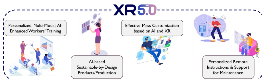
Fig. 2. XR5.0 Related Scenarios & User Journeys

3) Effective Mass Customization based on AI and XR : In this case, a product designer must use a Made-to-Order strategy to develop a customized product for a particular client. The designer will be able to generate numerous design possibilities by using a GenAI model thanks to XR5.0. Real-