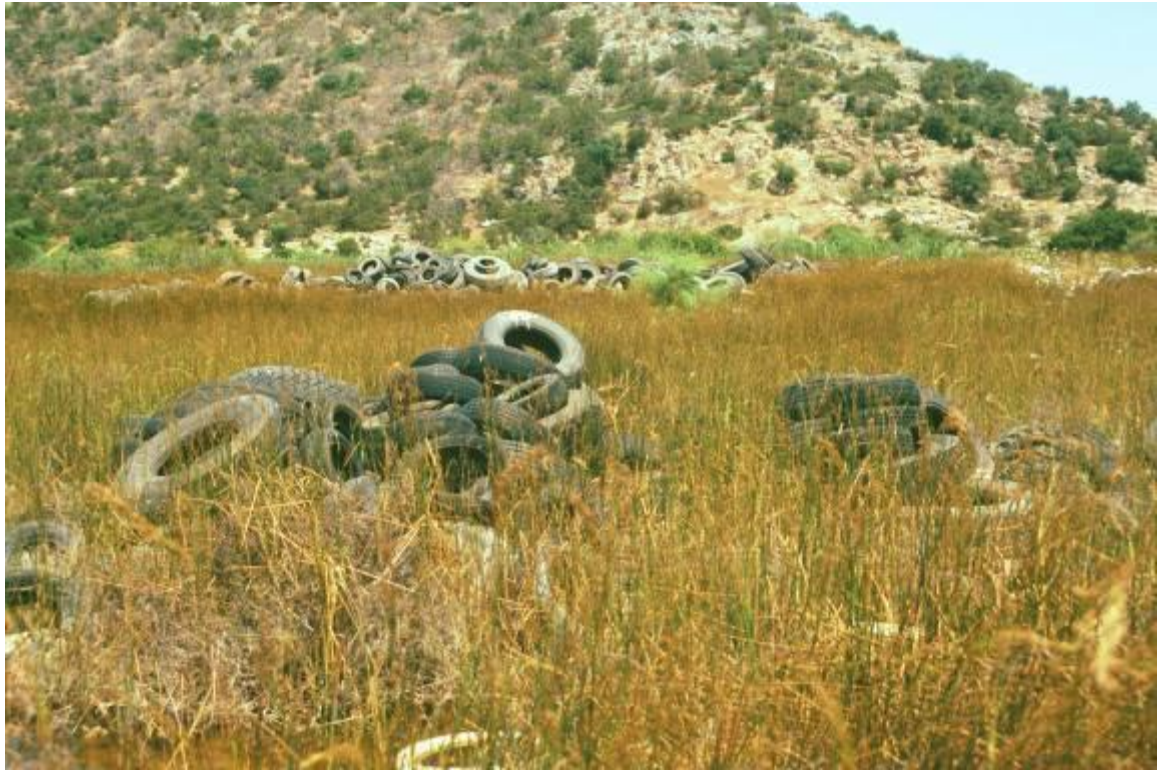
Figure 2: Debris in the wetland (1997)