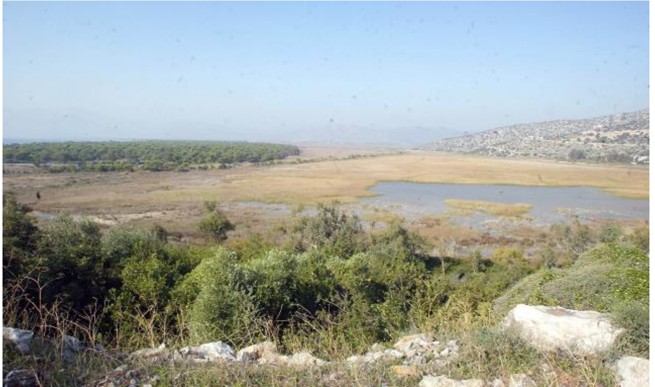
Figure 5: Panorama of the National Park (2005), photograph taken by the author