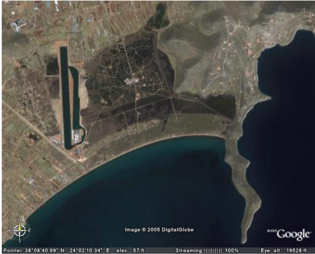
Figure 4: Schinias with the Rowing Centre (2005)