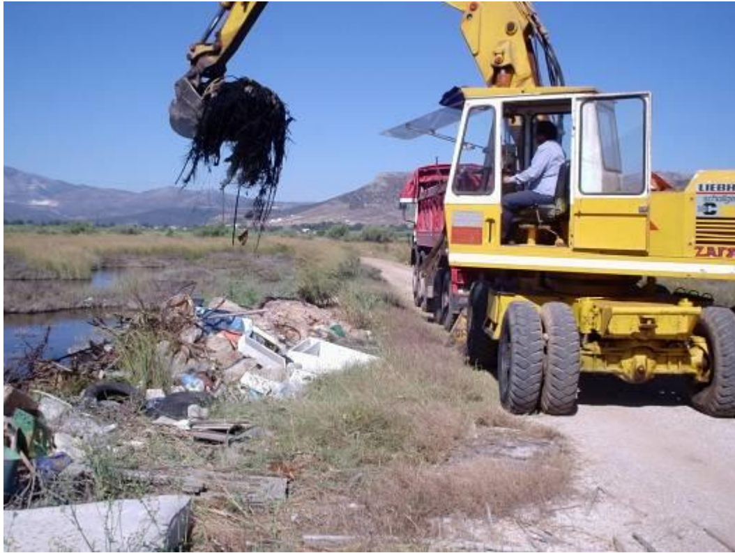
Figure 3: Cleaning the wetland (2004)