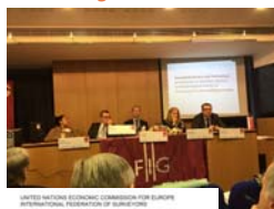
Formalizing the Informal Challenges and Opportunities of Informal Settlements in South-East Europe