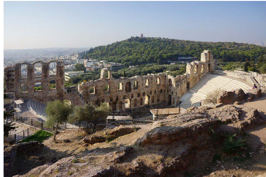
Pierrot Heritier photos