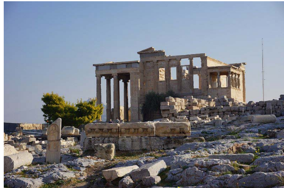
Pierrot Heritier photos