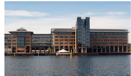
Complex housing the FIG Office, Copenhagen