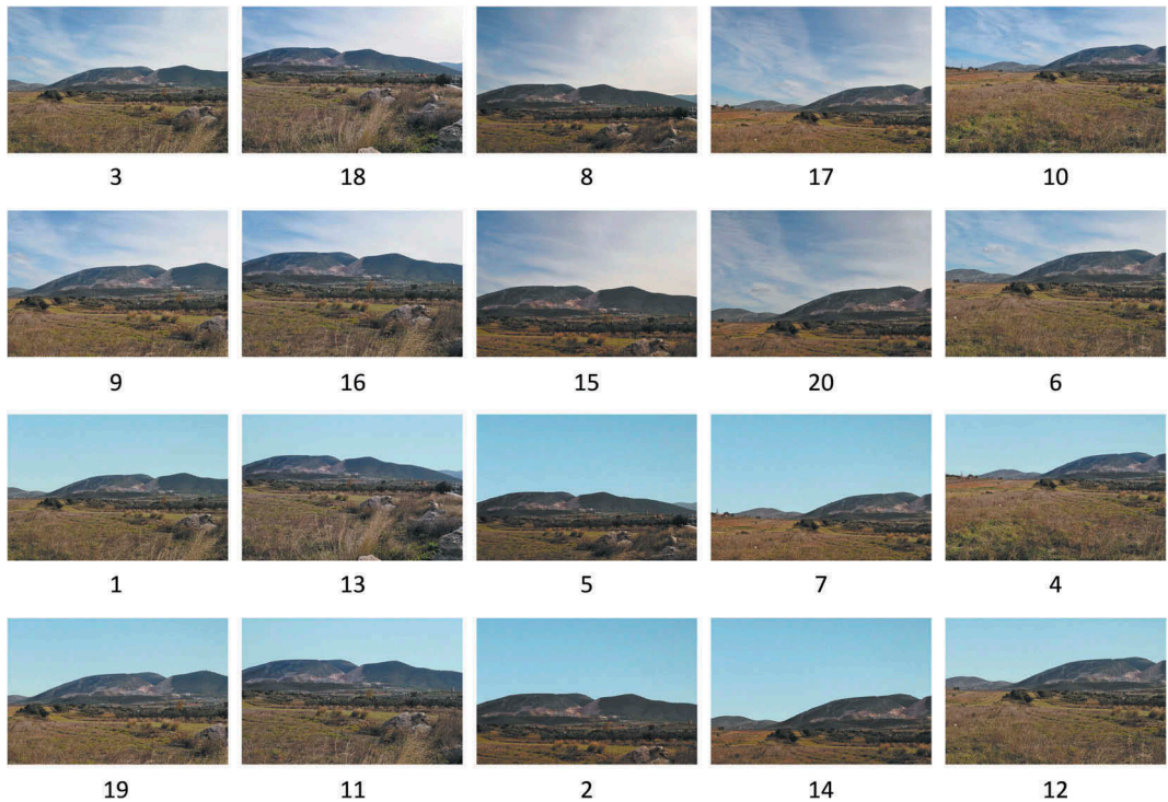
Figure 2. Visual stimuli (landscape photographs) utilized for the eye tracking experiment. In the top two rows, the photographs are presented under actual lighting and cloud cover conditions, while in the photographs in the two bottom rows the sky has been processed so as to be clear. Left to right, the placement of the open pit is changing, while top to bottom the focal length is changing. The numbering and categorization of photographs is in accordance with and results from Table 1.

Note 1: the numbering/order of photographs' presentation is explained in §4.4.2. Note 2: P0: Center, P1: Upper Left, P2: Lower Left, P3: Lower Right, P4: Upper Right.